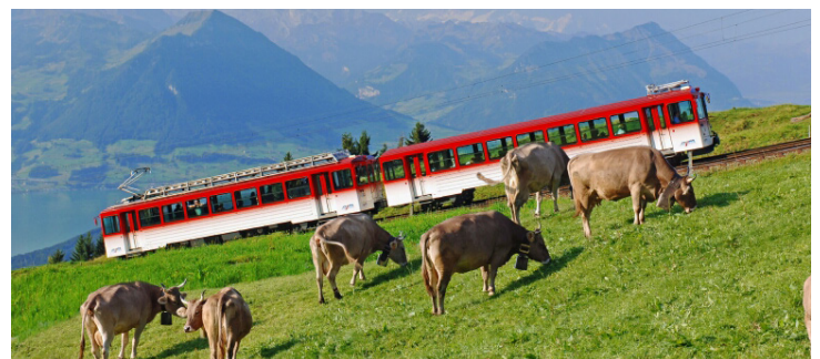
top: Wagner Museum, Tribschen below: Rigi cog rail train