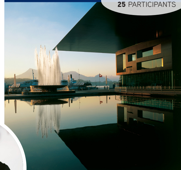
above: KKL Luzern—home of the Lucerne Festival left: Seong-Jin Cho