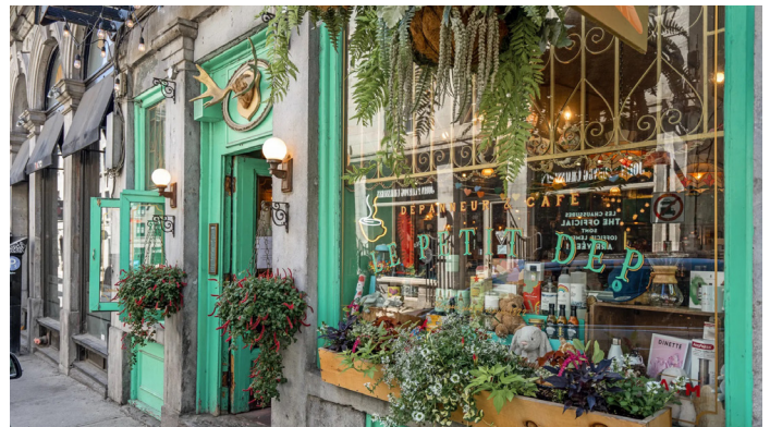
Rue Saint-Paul, Old Montreal

Itinerary subject to change. Meals in bold included in the price of the tour.