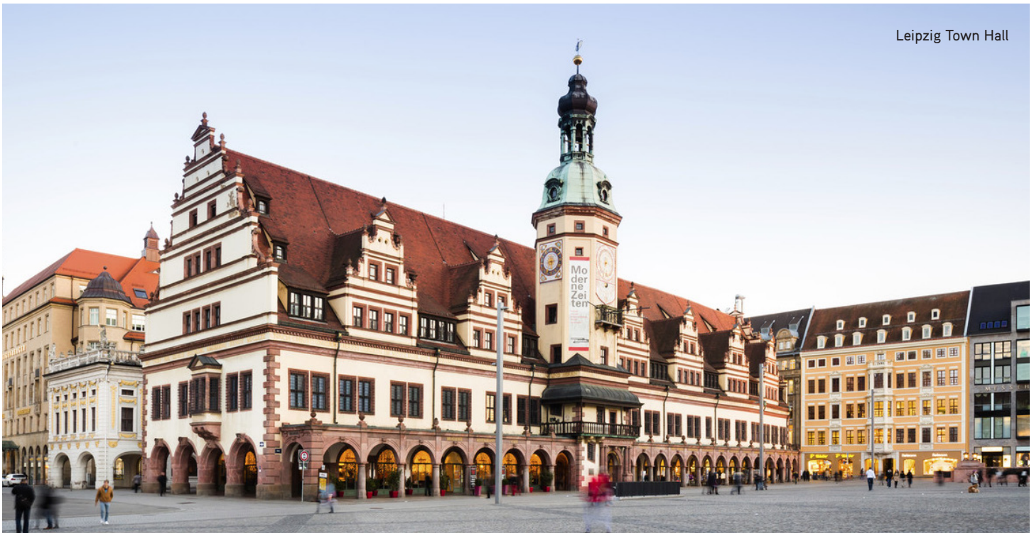
Leipzig Town Hall

The annual Leipzig Bach Festival, first begun in 1904, takes place all over the city in Baroque churches, impressive concert halls, and