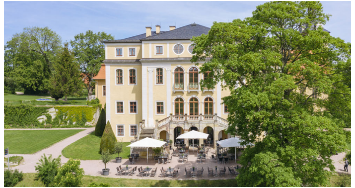
Ettersburg Castle, Weimar