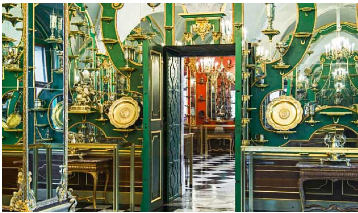
Green Vault, Dresden