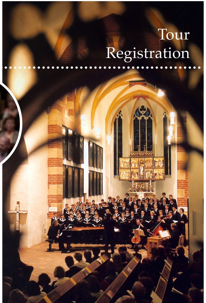
St. Thomas Church

Tour Cost: $5,390 per person, ground only, double occupancy.