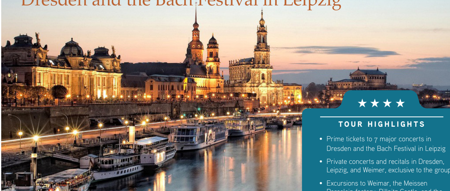
Dresden on the Elbe