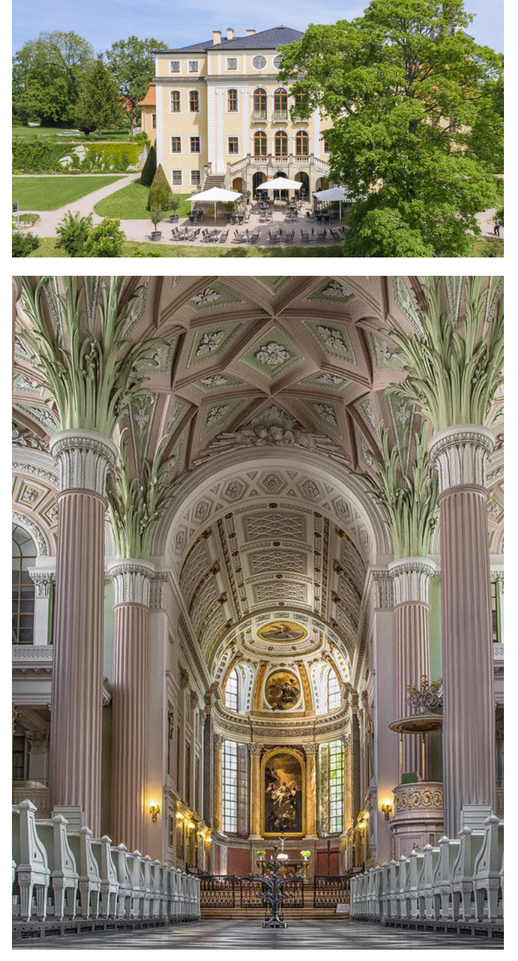
St. Nicholas Church, Leipzig below: Gewandhaus Orchestra