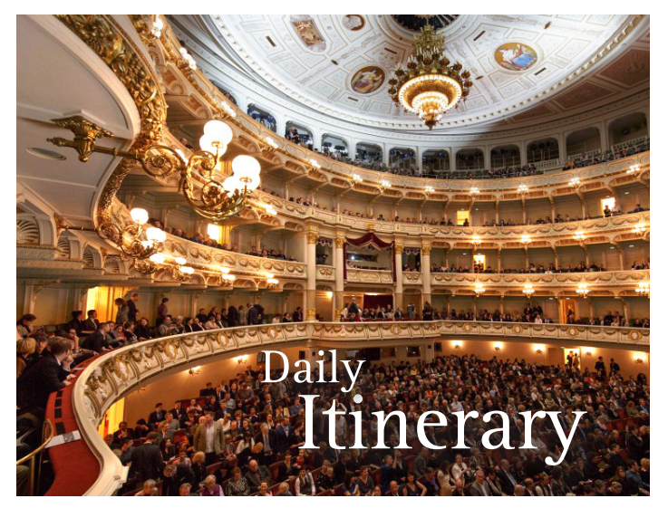
Dresden's Semper Oper

Friday, June 12 Group flight on Lufthansa departs Dulles Airport with arrival the following day.