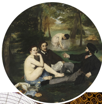
detail: Manet's, Le Déjeuner sur l'herbe

Meals in bold are included in the price of the tour.