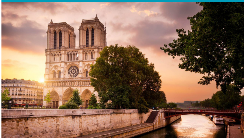
Notre Dame, Paris